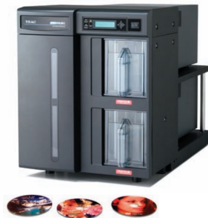
AP-55, Automated Dual Printer System shown here with 2 hi-resolution disc printers installed.

Note: Use TEAC recommended media for best results.